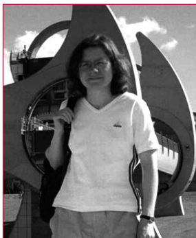
The author at a multi-circle site in Scotland