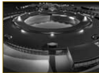
A view of the Diamond buildings published with permission of JacobsGIBB Ltd / Crispin Wride Architectural Design Studio.

Diffraction related beamlines form an integral part of the planning for Diamond, as can be seen from the straw plan that shows provisional positions for the Year-1, Year-2 and other possible beamlines. It should be stressed that this plan is provisional, and the Diamond Science Directors and the members of the Diamond Scientific Advisory Committee would welcome comments and suggestions from the general community. Crystallographers from the BCA are already contributing to the planning process. In November 2001, 16 beamline proposals were submitted to the Diamond SAC for consideration for development that would lead to them becoming operational in 2007. These included a high resolution powder diffraction beamline, a small molecule single crystal beamline, and a microfocus crystallography