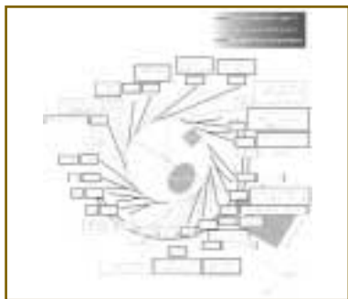
The straw plan published by courtesy of Diamond Light Source Ltd.

The BCA has appreciated the importance and potential of this new facility, and at the Nottingham Spring Meeting, in March, a Special Interest Group (the Diamond SIG) was set up, with a steering group