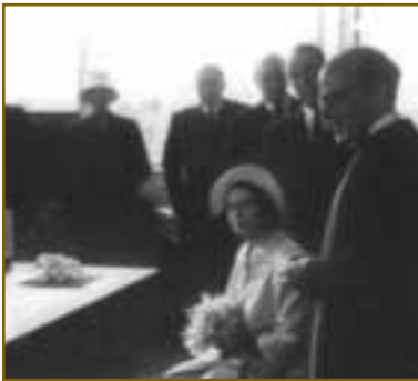
Max with H.M. the Queen